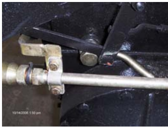
See step 24