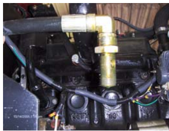
Cut hose behind fitting