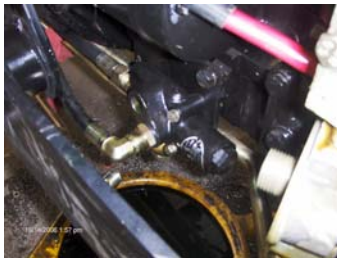
Take out banjo fitting