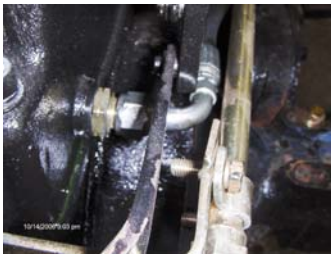
See step 26